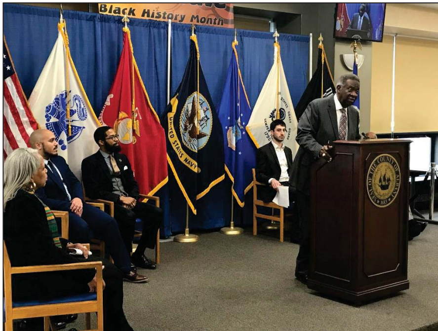
Legislative Black Caucus Chairman William Clay speaks during the African American History Month Celebration on Feb. 21 in the Cahill Room.

Members of the Legislative Black Caucus shared personal stories of their family’s migrating to Albany County during an event held Feb. 21 to celebrate African American History Month.